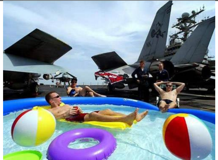
Navy pilots... r e a l l y tough duty.