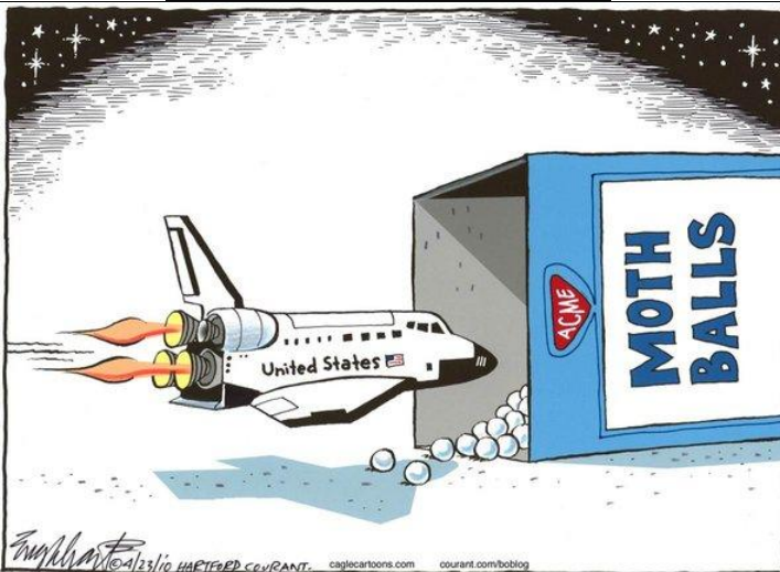
End of an era. What's next?

SAL Membership: did you sign up a new member this month?