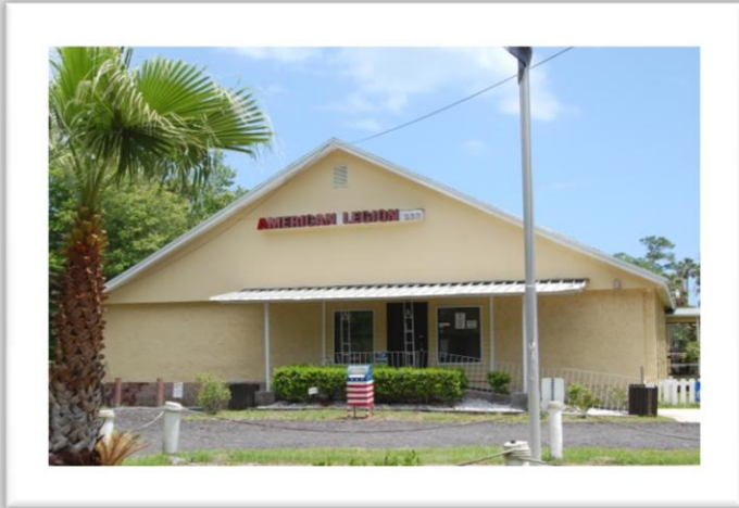
560 N. Wilderness Trail ~ Ponte Vedra Beach, FL 32082

Visit our cyber-post at www.AL233FL.org where you can view this newsletter in color