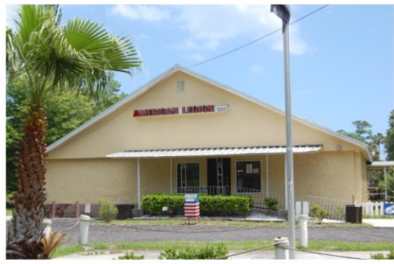
560 N. Wilderness Trail ~ Ponte Vedra Beach, FL 32082