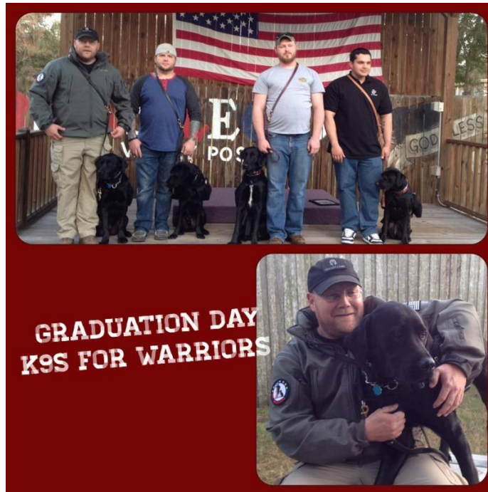
Thank you for your service and welcome home!

MIAP will hold its second “Call to Honor” on Friday, March 28, 2014. This service will be at 1:30pm at the Jacksonville National Cemetery and members of our communities are welcome to attend. We will inter 20 veterans whose cremated remains have sat on funeral homes shelves for decades.