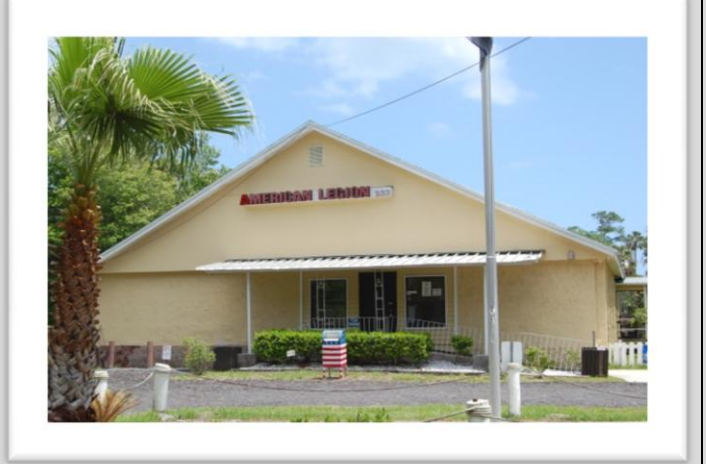
Visit our cyber-post at www.AL233FL.org