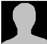
Pic coming soon