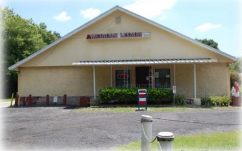
Our Post Home