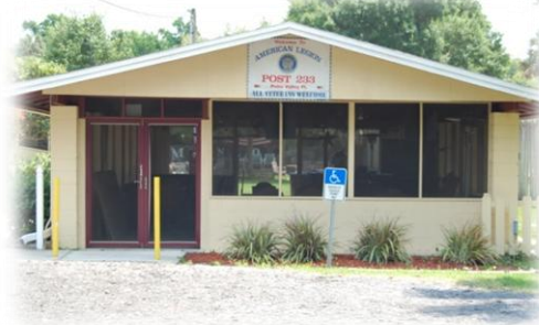
Commander Louis 'Pappy' Martin Pavilion

560 N. Wilderness Trail ~ Ponte Vedra Beach, FL 32082