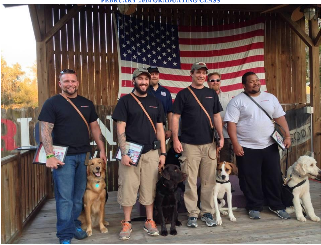
Thank you for your service and welcome home!