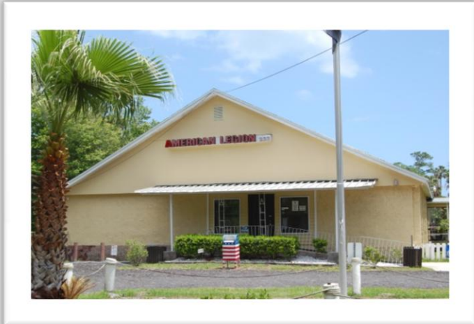
560 N. Wilderness Trail ~ Ponte Vedra Beach, FL 32082

Visit our cyber-post at www.AL233FL.org where you can view this newsletter in color